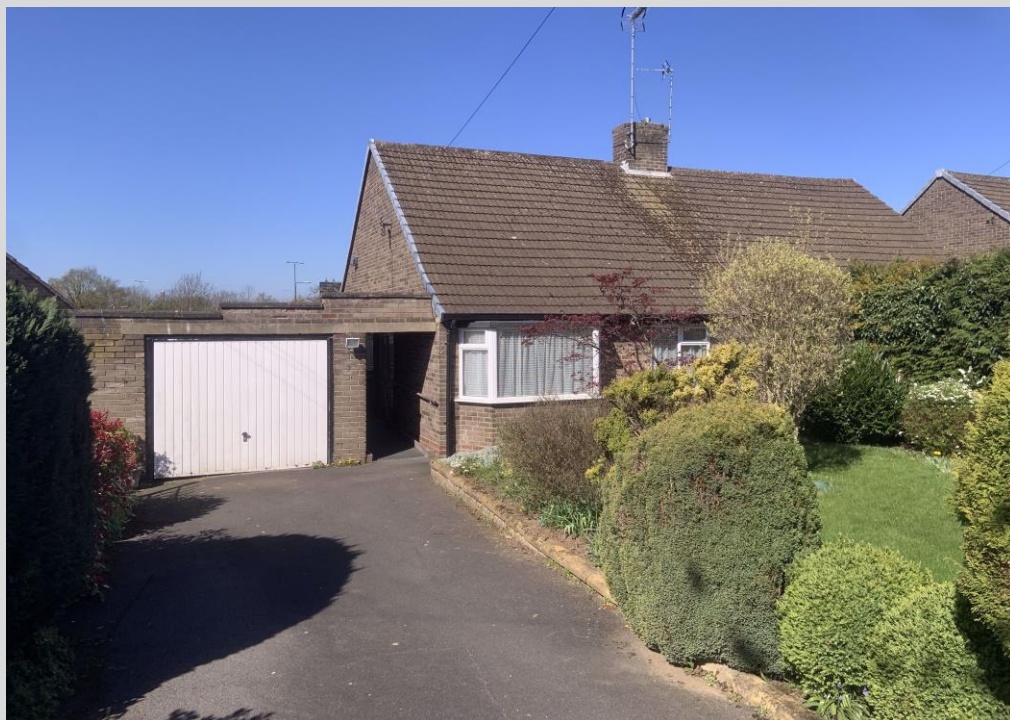
1 Silvey Grove, Spondon Derby, DE21 7GH

Three double bedroom semi detached bungalow set out with a busy retirement in mind. Very roomy yet easy to manage and including a spacious garden, caravan/boat standing space, a large garage with pit and access to hobby room with fitted cupboards. The third bedroom is currently fitted out as a home office and the property also includes gas central heating, double glazing, fitted wardrobes, a large living room and a spacious breakfast kitchen with a separate utility room. The bathroom has a wet room floor and outside is a shallow ramp to the property, which of course could be easily removed if not required.